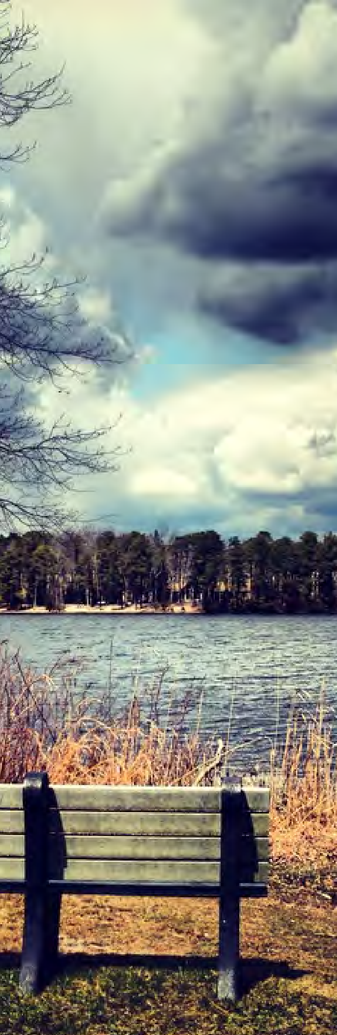
Photo below (alongside Fruity Cows).