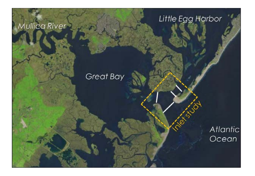
Figure 1 . Map of Little Egg Inlet study area (yellow box). White lines are proposed survey transects of each branch of the inlet. During each survey, the transect lines will be repeated in a circuit for 14 hours to cover a full ebb and flood of the tide.

I have prior experience in the methods required for this study from my graduate and postdoctoral work [4]. I have access to the necessary equipment and software for data collection at Stockton, which I have used to conduct demonstration surveys with students in my MARS 3309 Coastal Oceanography course (Fig. 2). Finally, I collected preliminary data at a single fixed station in August 2017, prior to dredging activity, and received Provost Faculty Opportunity Funds to repeat the fixed station data collection in Spring 2018. However, measurements at fixed stations lack complete spatial information about water velocity, which often has high variability from one side of an inlet to another (Fig. 2).