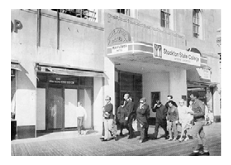
Stockton State College, 1971

Governor Murphy's funding initiatives have helped Stockton's tuition and fees remain competitive among the state colleges. However, the University still receives the lowest amount of state support for its operating budget. Stockton students deserve more. The University needs equitable support from the State to provide the services that students need to be successful.