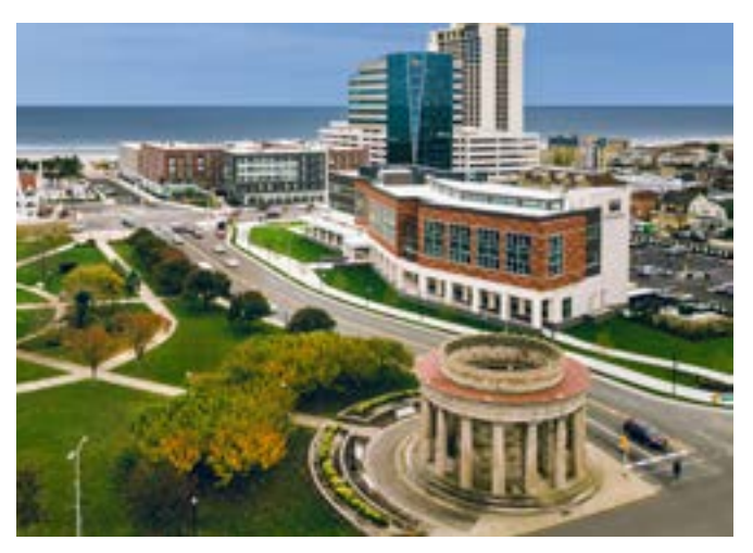
Stockton University Atlantic City, 2019