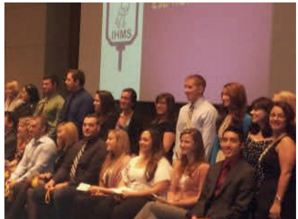
Inductees read their pledge to uphold the principles of the International Hospitality Management Honor Society