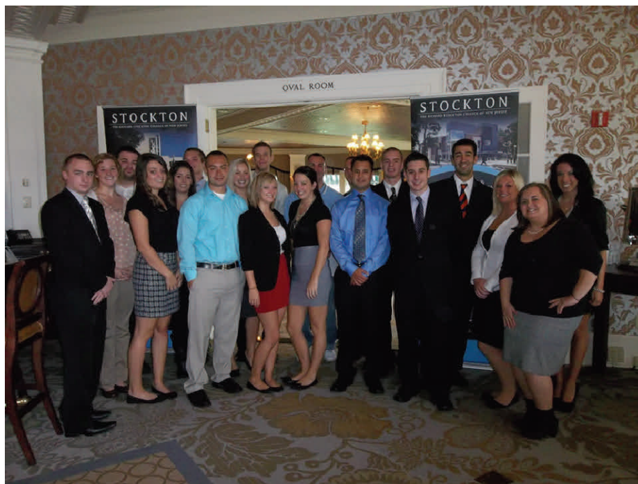
Fall 2011 HTMS Co-operative education class attending the Stockton/Cornell signing at the Seaview Resort, September, 2011.