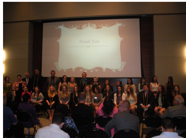
Students inducted into Eta Sigma Delta

Service activities for ESD occurred during the month of March with students volunteering in multiple events including the Community Food Bank of South Jersey, where students worked in a mobile pantry which was stationed in various locations in the area including Ventnor, Galloway, and Egg Harbor City. Even in snow and freezing temperatures, students were handing out food and helping the community. Students also had the opportunity to volunteer and participate in the New Jersey Travel Industry Association's Conference on Tourism held at The Golden Nugget in Atlantic City.