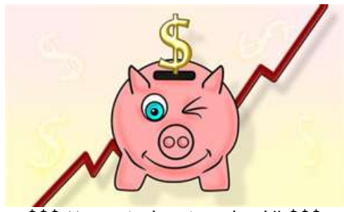
$$$ Money in the piggy bank!! $$$