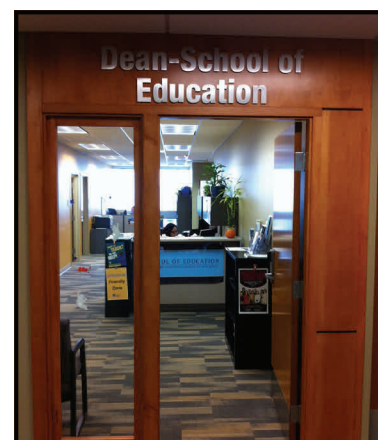
The J201 Office Suite