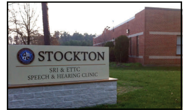
Visit the SRI & ETTC at 10 Jimmie Leeds Road (near GS Parkway)

www.etc.net/calendar/pdfs/first_year_experience.pdf