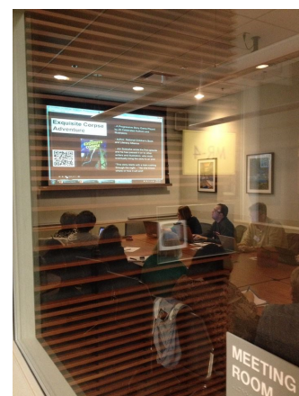
A breakout session at LIB 2.0 in the Stockton Campus Center Meeting Room. Participants share a screen to learn about useful resources.

Remember to "Like" us on Facebook and get daily teaching tips and more.