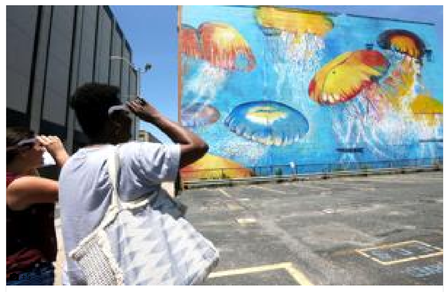
48 Blocks provides interactive experience with Atlantic City mural tour