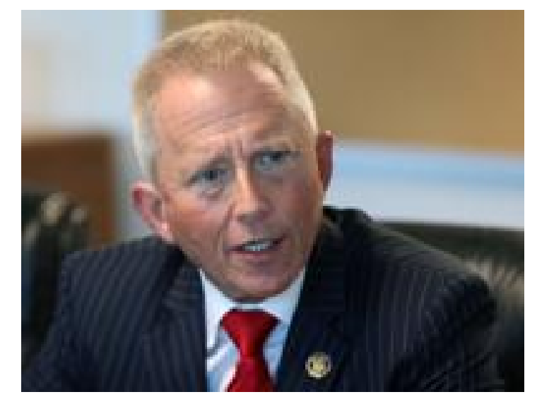
Van Drew

Then he was one of the few Democrats calling for bipartisan compromise on a budget to end what became the longest federal government shutdown in history.