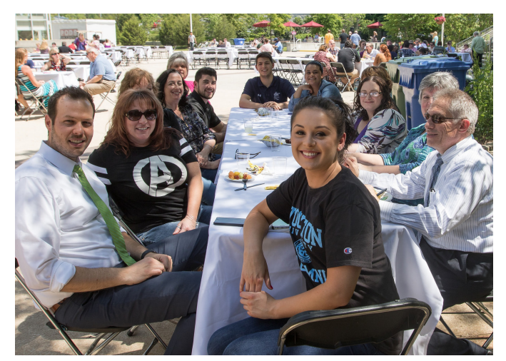
Some members of the Stockton community braved the heat outside while others chose to stay cool in the Campus Center at Stockton's second annual community BBQ.