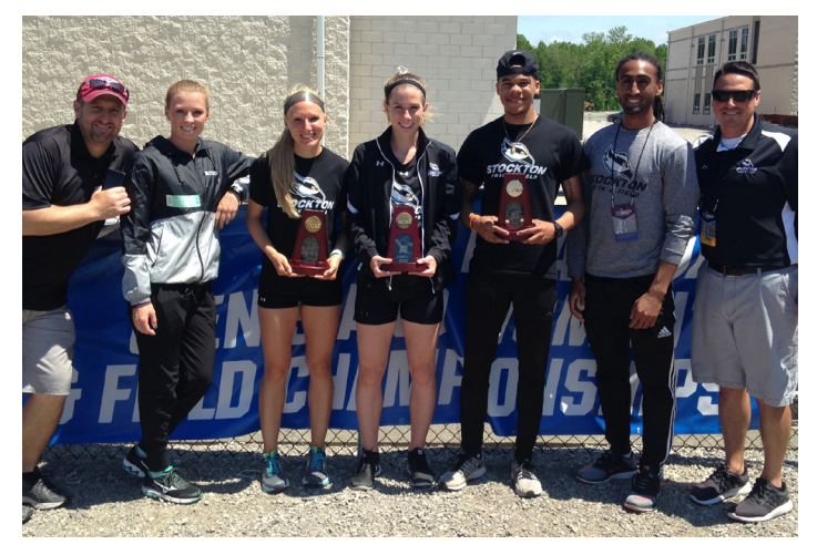
Three Stockton student-athletes were named All-American at the 2017 NCAA Division III Outdoor Track & Field Championships.

All three Ospreys rose to the occasion by recording personal bests on the day.