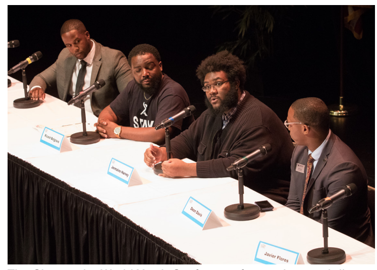
The Change the World Youth Conference featured a panel discussion of Stockton students and alumni.

"We work hard to provide our students with an exceptional environment where they can grow and learn and challenge themselves. Our goal is to impart on our students that they can do anything," he continued.