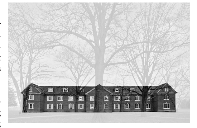
"New Jersey Manual Training and Industrial School for Colored Youth" (Bordentown, N.J.) from Wendel White's exhibit, "Schools for the Colored."

One of his favorite pieces is a photograph from, "Schools for the Colored" – the Bordentown School, or the New Jersey Manual Training and Industrial School for Colored Youth, a once segregated boarding school that operated until 1955. He emphasized the irony of this piece; the building now acts as a juvenile detention center.