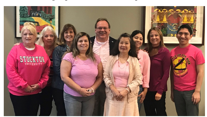
Stockton University's Bursar staff wore pink on Oct. 25 to show their support during Breast Cancer Awareness month.