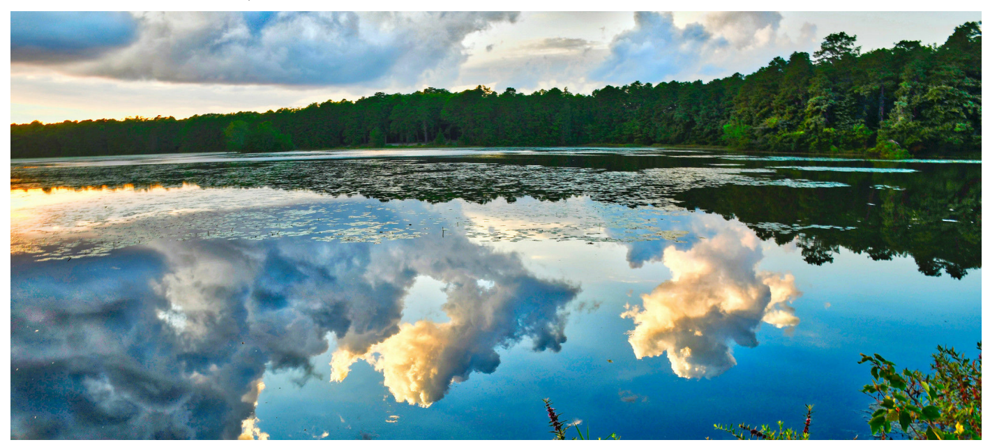
We cannot wait to have you and your students back on our beautiful campus soon!