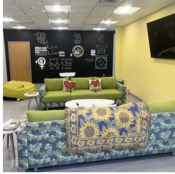
WGSC's brand new lounge!