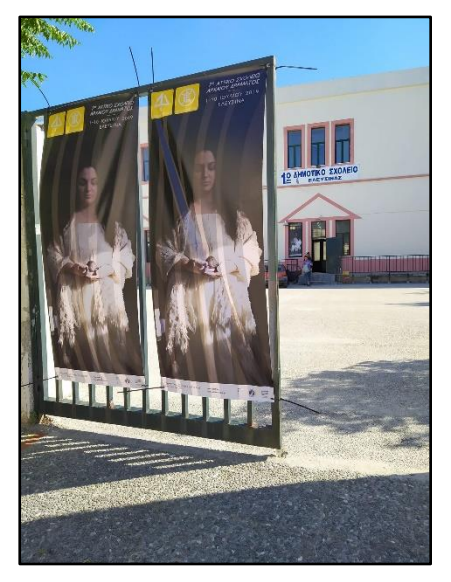
Local School in Elefsina; Location of Workshop

dramatic expression, these lectureworkshops, for my part, deepened my theretofore shallow understanding of the acting process.