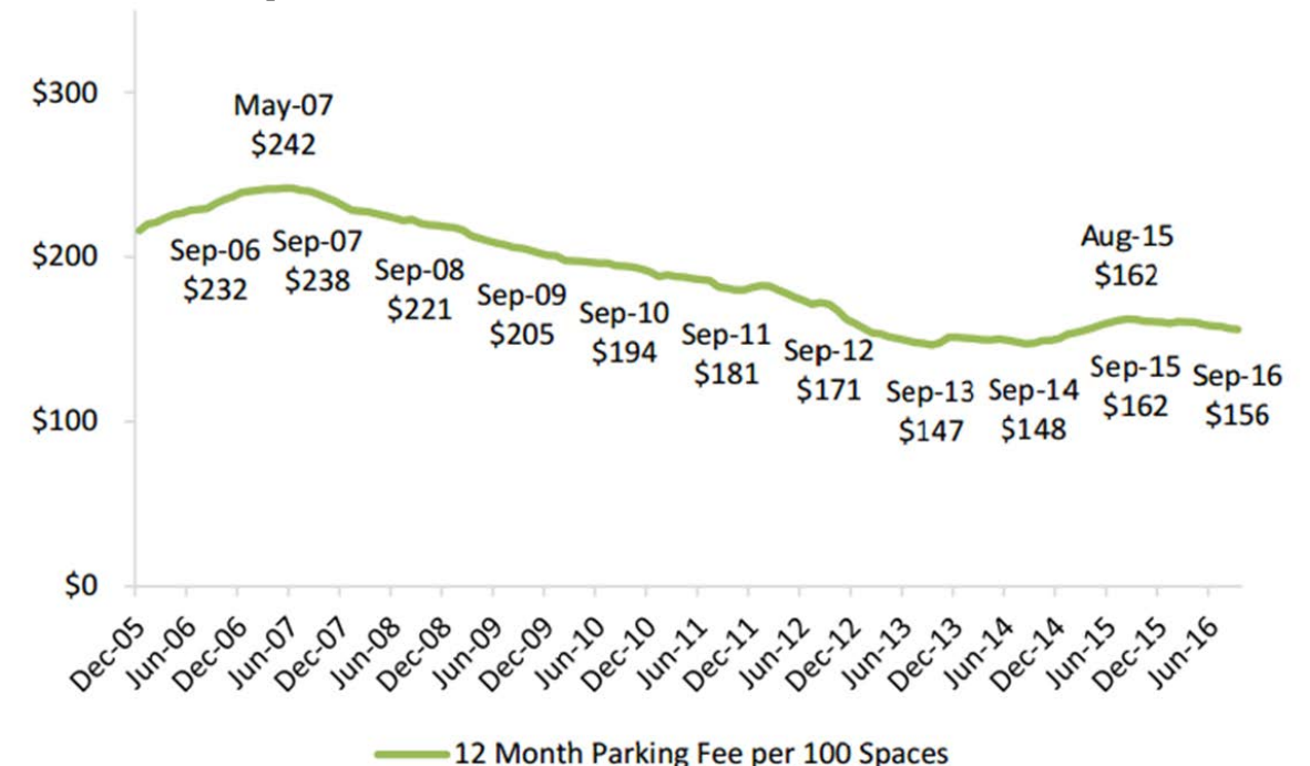
Figure 5: 12-Month Trailing Total for the Atlantic City Casino Parking Fee per 100 Parking Spaces, December 2005 to September 2016