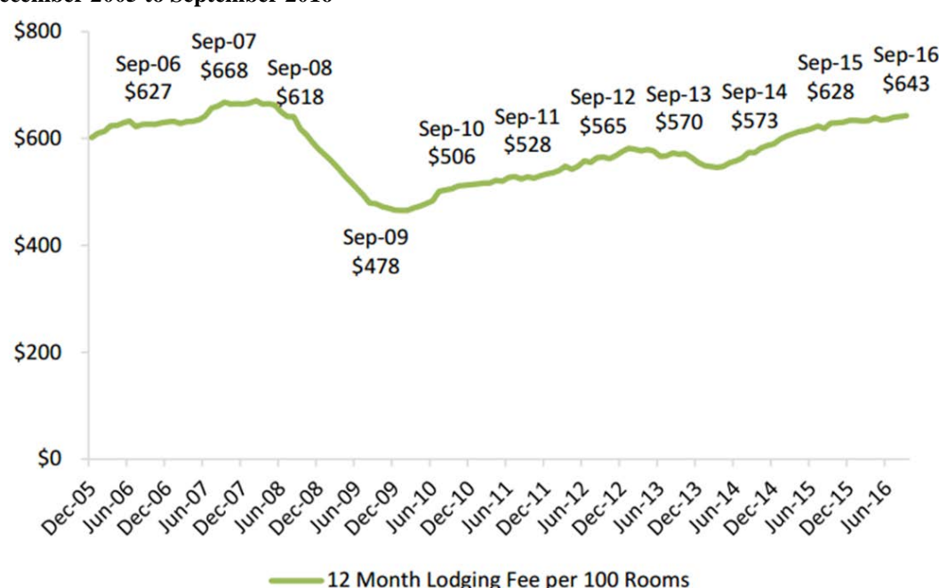
Figure 6: 12-Month Trailing Total for the Atlantic County Lodging Fee per 100 Rooms, December 2005 to September 2016