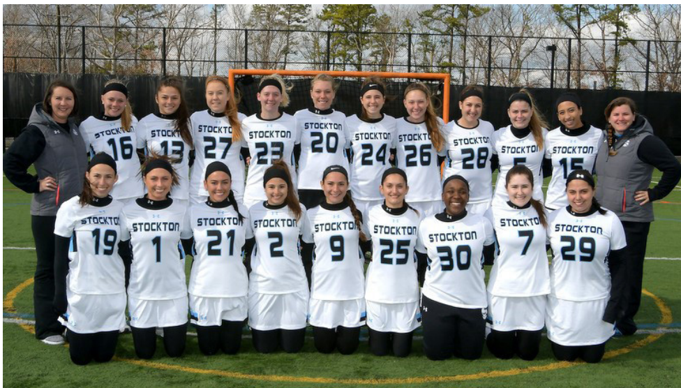
The 2017 Women's Lacrosse Team was recognized as a Zag Sports Academic Honor Squad by the Intercollegiate Women's Lacrosse Coaches Association.

The 2017 women's lacrosse team and three student-athletes qualified for academic recognition from the Intercollegiate Women's Lacrosse Coaches Association (IWLCA).