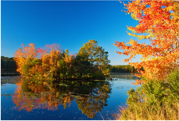
Photo of Lake Fred by David Carr. View more of Carr's photos here .

David Carr spent the last year roaming the main campus in Galloway with a purpose. Coming to campus at all hours of the day and night, Carr photographed scenes in a variety of perspectives and lighting to capture the natural beauty of our University located in the Pinelands National Reserve.