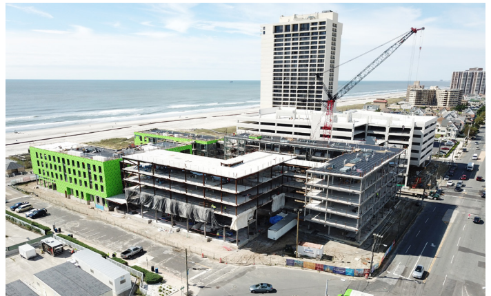
A drone view of the construction progress on the Atlantic City Gateway Project shows the magnificent ocean view from the future residence hall (wrapped in green and in the foreground).