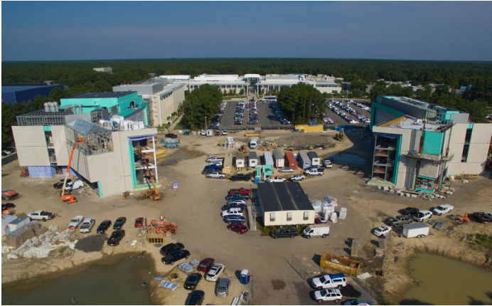
A drone photograph taken earlier this week showcases the progress made on what will soon be the new main entrance to the University.